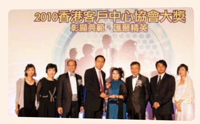
Our call centre received 2 corporate awards and 11 individual awards from the Hong Kong Call Centre Association in 2010