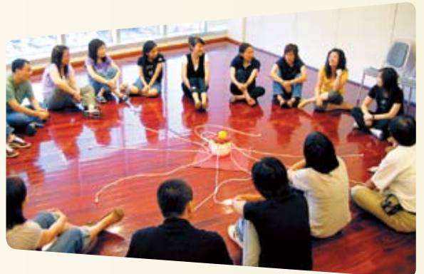
We organise staff training courses from time to time to build team spirit through interactive and innovative activities