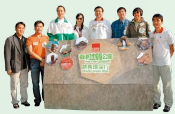
The Hong Kong Geopark Charity Green Walk, spearheaded by BOCHK since 2009, is well received by the public

Since 2009, we have participated in the global environmental initiative "Earth Hour" organised by WWF to raise public awareness of the global climate change through the act of switching off lights. We also signed the first "Dim It" Charter, making an open commitment to conserving energy and reducing carbon dioxide emissions, light pollution and light nuisance. At corporate banquets, shark's fin, endangered reef species and black mosses have no longer been served since 2009. To enhance our support to conservation of sharks and help reversing the global decline in shark species, the Group signed the "No Shark's Fin Pledge" initiated by WWF Hong Kong in 2011, pledging to stop the supply or serving of shark's fin or provision of any promotions relating to shark's fin.