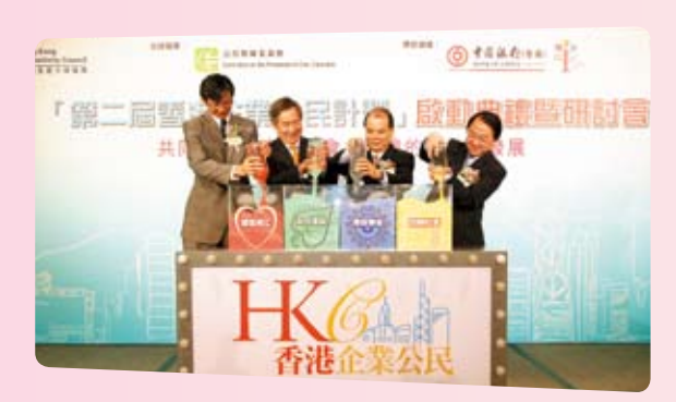
We sponsored the Hong Kong Corporate Citizenship Programme organised by the Hong Kong Productivity Council for two successive years to promote sustainability of society

BOCHK has supported the Chest's Charity Golf Day as the title sponsor for two successive years. Participating corporations and organisations formed different teams to hit the greens and raised over HK$1.8 million in 2011to benefit the support and recovery services for mentally ill patients. In addition, the Group also supported the Charity Golf Tournament organised by the Sowers Action in May 2011 by inviting corporate customers to take part. A total of HK$630,000 was raised and donated to subsidise the reconstruction projects of secondary or primary schools in the Mainland mountain regions.